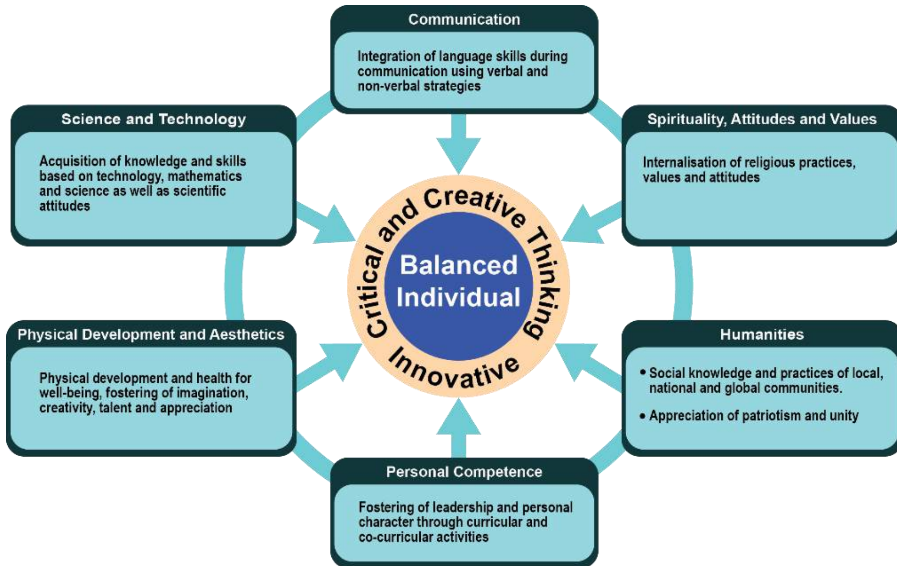
Figure 1: The Standards-Based Curriculum Framework for Primary Schools